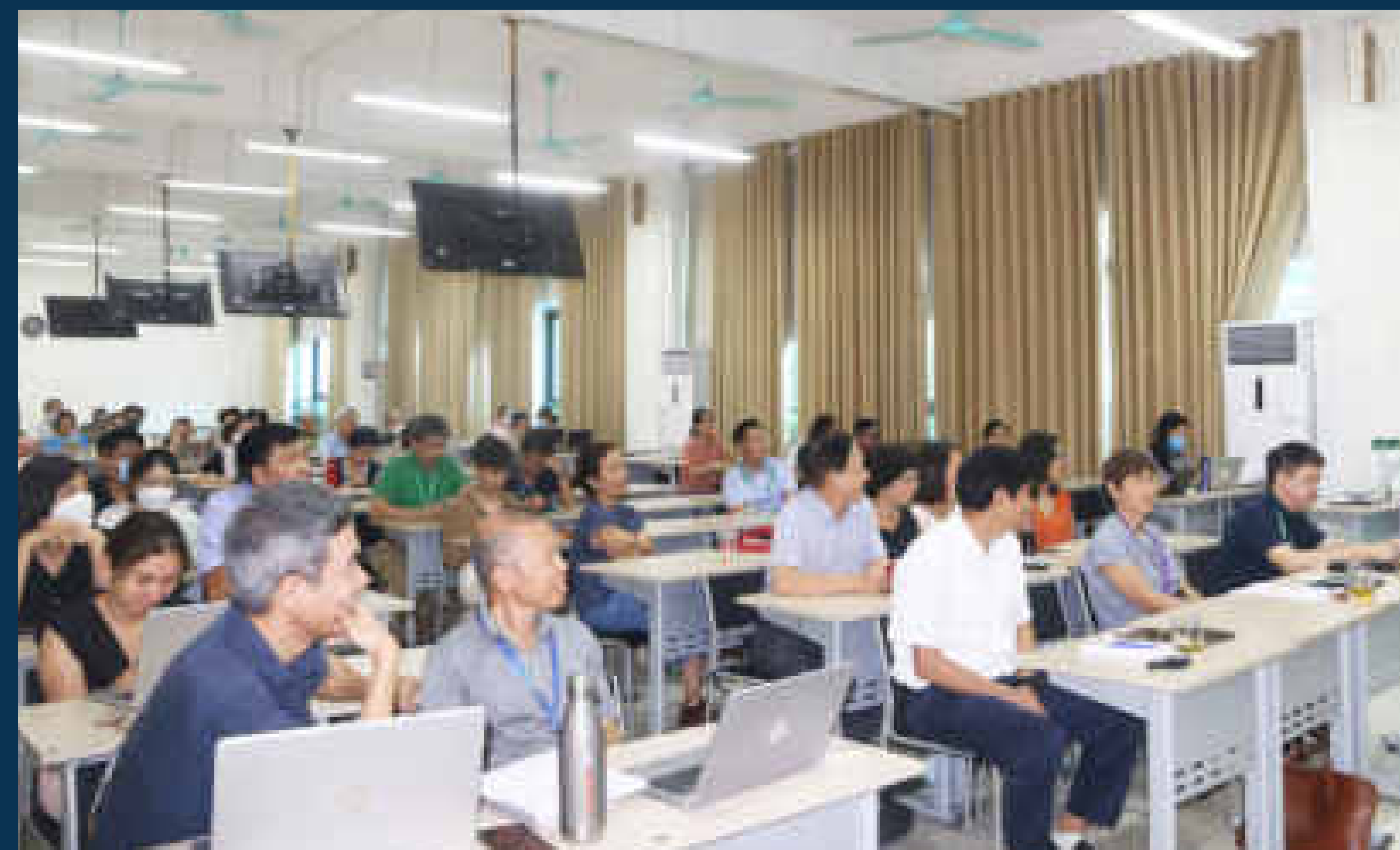
Non-Communicable Diseases and Policy Advocacy