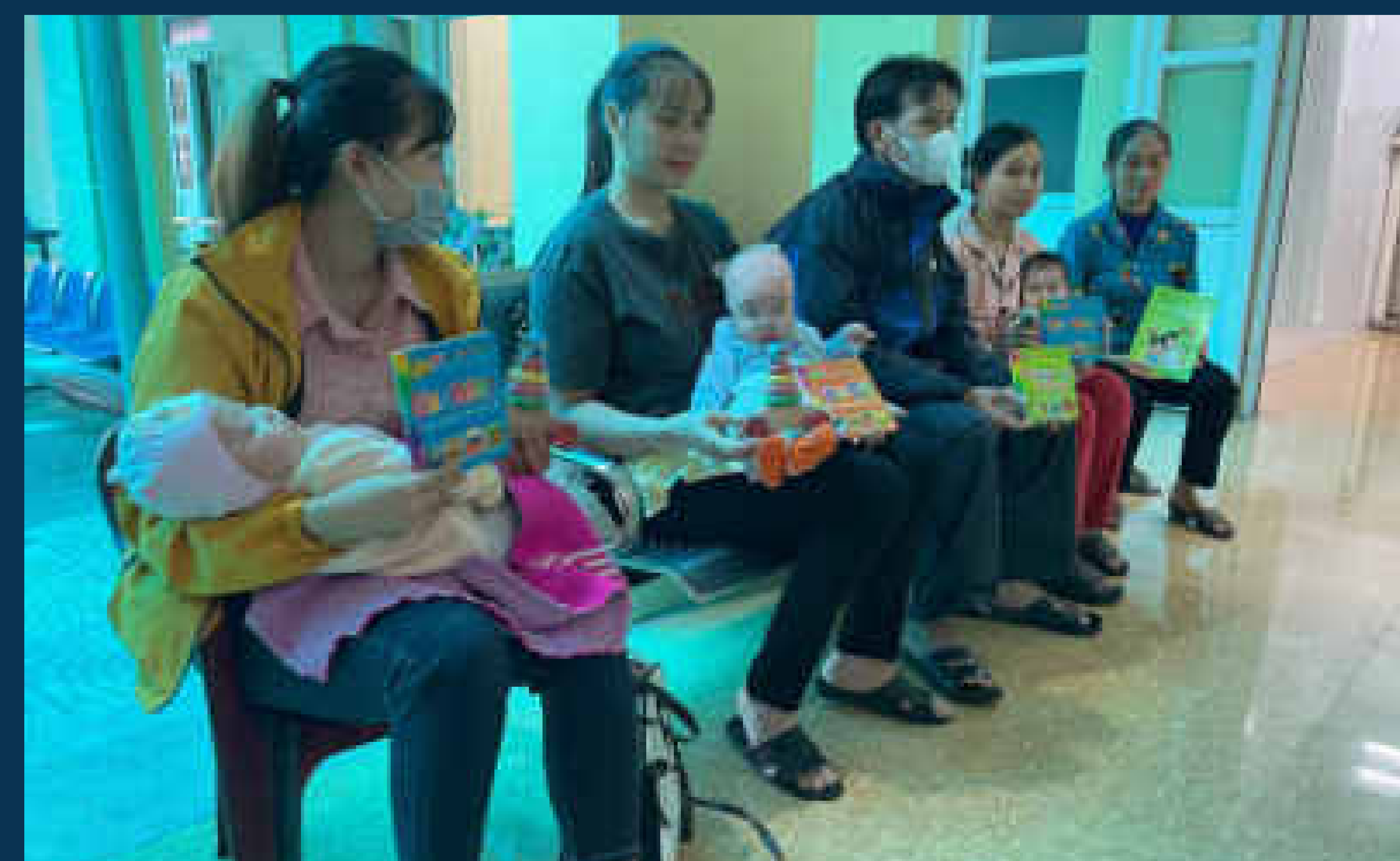
Early Childhood Development